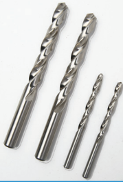
"Hurricane" ® HARDWARE DRILLS