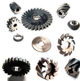
HSS MILLING CUTTERS